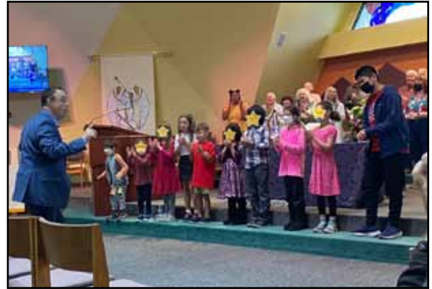
We helped lead the service!