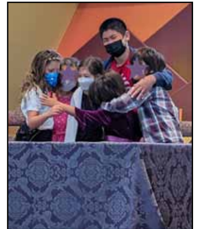
Showing how all the people of the world can live in harmony