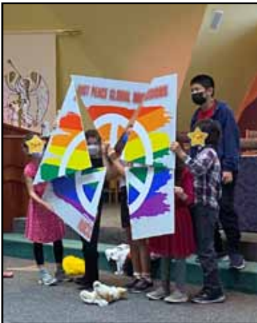
We imagined a new loving and justice-filled world together