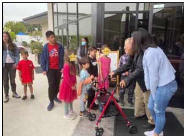
Greeting the congregation after the service