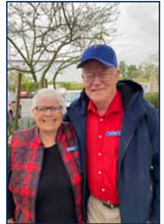
Pancakes for Pentecost on May 28 - Happy Birthday, Church!