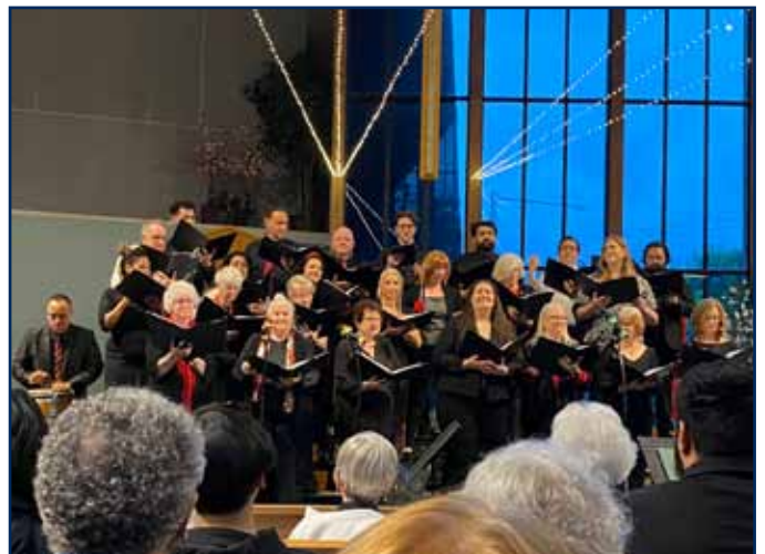
IUCC Chancel Choir performing alone